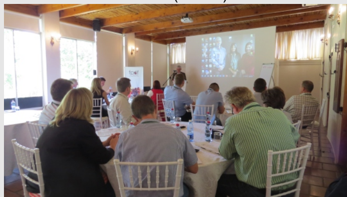
FPEF members at our Annual General Meeting (AGM), hosted at Rhebokskloof in Paarl on 24 November 2016.