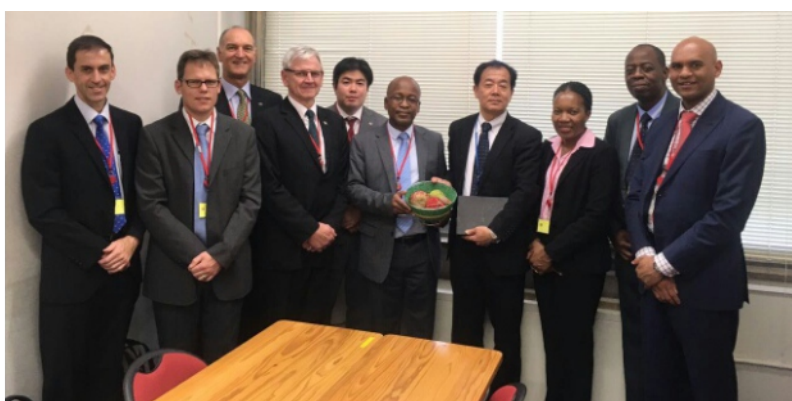
The South African pavilion at the China World Fruit and Vegetable trade fair in Beijing, and the FSA delegation meeting with the Japanese Ministry of Agriculture, Forestry and Fisheries (MAFF) in Tokyo.