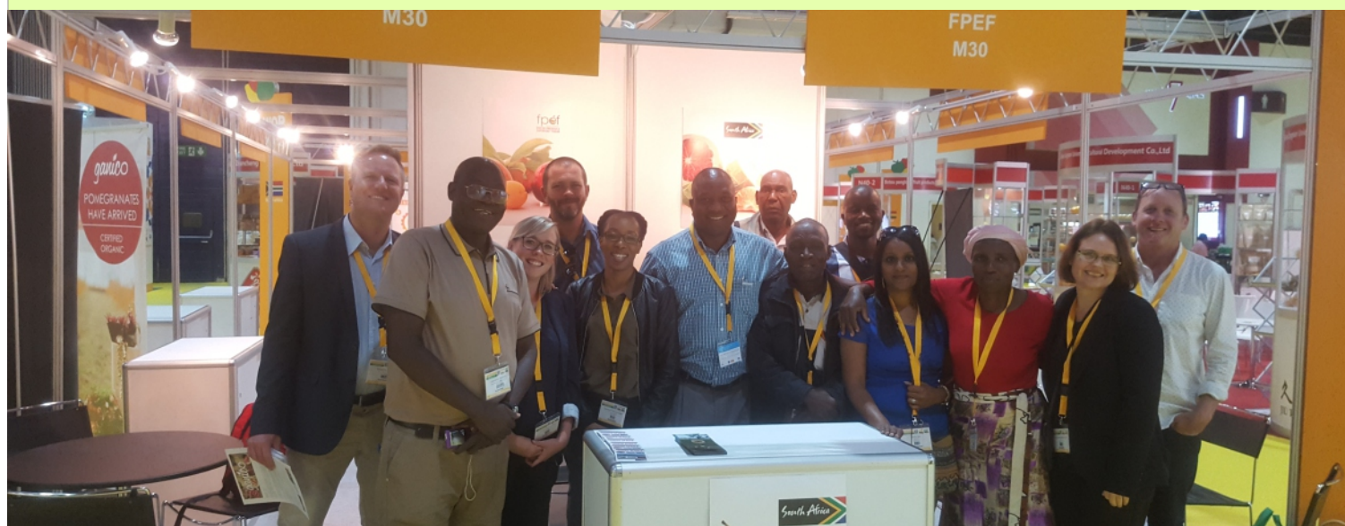
The South African delegation at WOP Dubai 2016.

The fair not only provided the emerging producer-exporters with valuable exposure to the international fresh produce industry, but it also enabled the FPEF to gather trade leads and raise awareness about South African fruit.