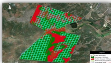
Ikamva Lethu Farm Layout

In the meantime, work on the environmental impact assessment continues. By its nature this is a lengthy and time-consuming process which is being thoroughly managed by the EIA consultants and which should be completed and