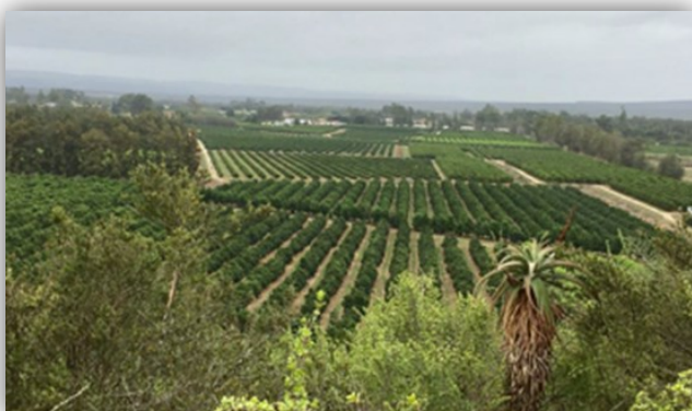
A beautiful view of the Sikhula Sonke Enterprises farms (above)

At Glengrove farm, the roads are in the process of being maintained with limestone in order to prevent damage to the fruit in transit as well as wear and tear on the vehicles. The windbreaks that were removed and chipped up, were also scattered among the trees for nourishment. The farm is in excellent condition and the crop for the 2017 season ready for harvest.