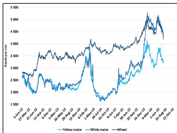
Chart 2: RSA maize and wheat prices