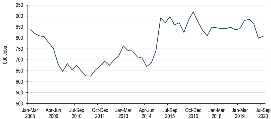
Exhibit 1: South Africa's agriculture employment

Looking ahead, the agricultural sector is poised for another good year on the back of an expected La Niña. This means that there will be increased activity in the sector, which would sustain employment, at least at levels above 750 000, in our view. We continue to worry about the financial conditions of the wine industry as the impact of the lockdown regulations will be far lasting on the industry. This, in turn, will have implications for primary agriculture employment, specifically in the Western and Northern Cape.