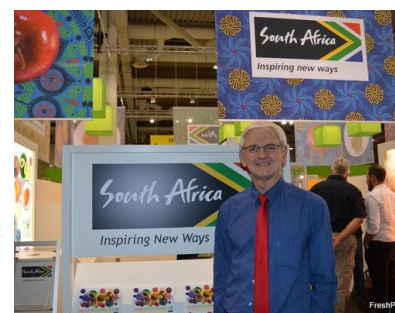
TABLE GRAPE NEWS

https://www.freshplaza.com/article/9282709/20-years-of-the-representing-south-african-fruit-to-the-world/