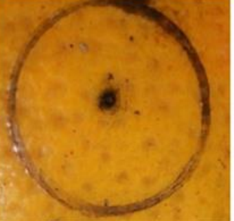
Early stage (CBS-positive)