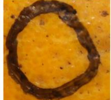
Healthy spot on healthy sample (CBS-negative)

Port of Cape Town: The FruitSA shipping meeting has taken place providing necessary action items to execute during the deciduous and throughout the citrus season. Additionally, the FPEF and PPECB will participate in discussion and also onboarding cold stores wishing to make use of 24-hour inspections. This will improve nighttime reefer container exporters alleviating much needed pressure from the port. Inland container depot facilities remain a top priority in the short and medium term. Increasing the number of facilities and improving utilisation of existing facilities (e.g., Belcon), could make a significant difference while deciduous fruit export volumes will rapidly increase from week 5 and onwards. In conjunction with Belcon, rail opportunities between Belcon, Cape Town and Port Elizabeth should be prioritised by TFR. Industry will revisit these options in the near future.