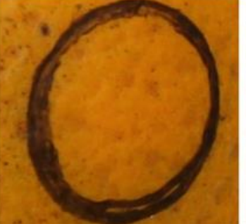
Healthy spot on infected sample (CBS-positive)