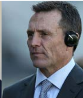
Joel Stransky SA Rugby Legend